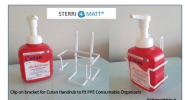
SMATT-WCSC Cutan Bracket