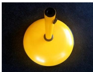
SMATT-WCSB Static Base