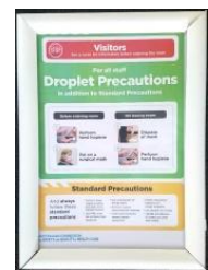
SMATT-WCSF double sided warning sign.