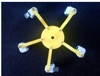
SMATT-WCSM Mobile Base